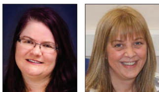
Authors: Emily Haesler and Karen Ousey

In 2016, the International Wound Infection Institute reviewed the wound infection continuum through a literature review and formal Delphi process. This article discusses some significant changes made to the wound infection continuum, including changes in terminology used to describe phases of wound infection, and distinction between early (covert) signs of local infection and the overt classic Celsian signs. Clinical indicators of potential biofilm in a wound, which were agreed on by experts as part of the Delphi process, are explored. An overview of strategies to manage local wound infection, and the important role of antiseptics in providing an option for early action against microbial proliferation, are also presented.