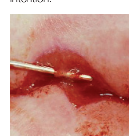
Figure 3 | Bridging Infection may result in incomplete wound epithelialisation with strands or patches of tissue forming 'bridges' across the wound. Bridging can occur in acute or chronic wounds healing by secondary intention.